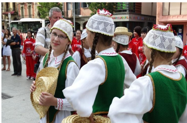
International Music Festival of Cantonigròs